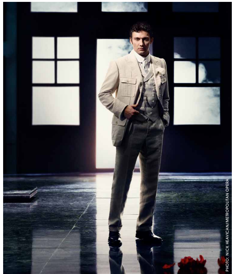
Jonas Kaufmann in the title role of Gounod’s Faust .