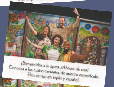
¡Bienvenidos a la ópera ¡Abrazo de oso! Conozca a los cuatro cantantes de nuestro espectáculo. Ellos cantan en inglés y español.