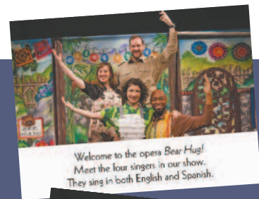
Welcome to the opera Bear Hug! Meet the four singers in our show. They sing in both English and Spanish.