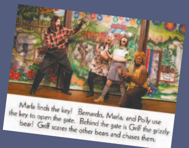
Marla finds the key! Bernardo, Marla, and Polly use the key to open the gate. Behind the gate is Gruff the grizzly bear! Gruff scares the other bears and chases them.