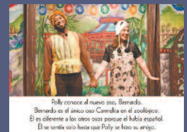
Polly conoce al nuevo oso, Bernardo. Bernardo es el único oso Camelia en el zoológico. Él es diferente a los otros osos porque él habla español. Él se sentía solo hasta que Polly se hizo su amigo.