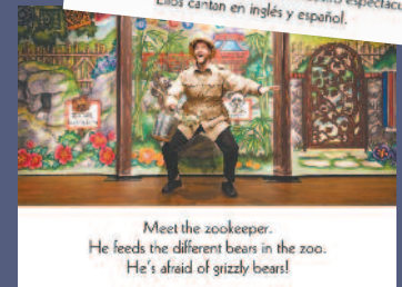
Meet the zookeeper. He feeds the different bears in the zoo. He's afraid of grizzly bears!