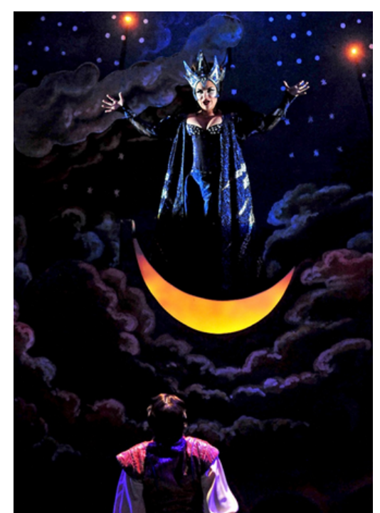
Nashville Opera's 2013 Production of THE MAGIC FLUTE

This is the highest female voice and has a range similar to a violin. In opera, the soprano most often plays the young girl or the heroine (sometimes called the prima donna), since a high bright voice traditionally suggests femininity, virtue, and innocence. The normal range of a soprano is from middle C through two octaves above middle C, sometimes with extra top notes. Most women are sopranos. In THE MAGIC FLUTE, Pamina, the Queen of the Night, and Papagena are played by sopranos.