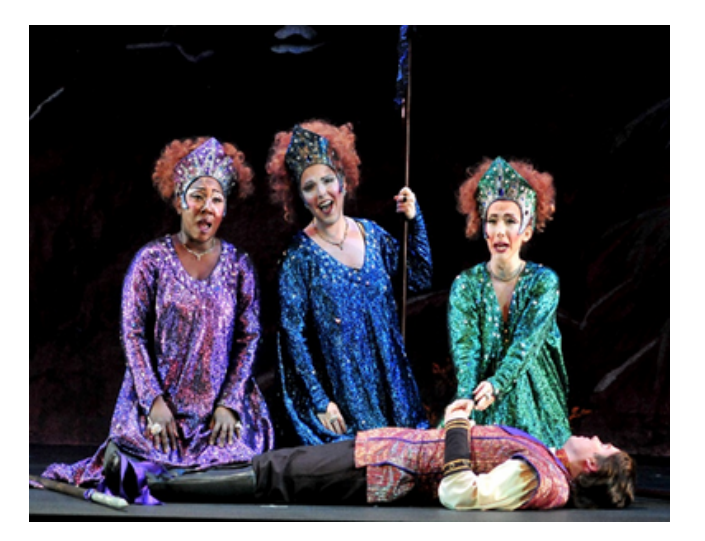
Nashville Opera's 2013 Production of THE MAGIC FLUTE

Also called a mezzo, this is the middle female voice with a range similar to an oboe. A mezzo's sound is often darker and warmer than a soprano's. In opera, composers generally use a mezzo to portray older women, villainesses, seductive heroines, and sometimes even young boys. Mezzo-sopranos also often serve as the friend or sidekick to the soprano. The mezzo-soprano's normal range is from the A below middle C to the A two octaves above it.