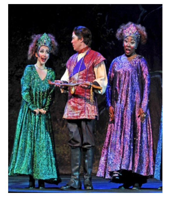
Nashville Opera's 2013 Production of THE MAGIC FLUTE

Opera is full of emotion, passion, human conflict, and discovery. Nashville Opera usually presents operas in their original language and projects supertitles above the stage so the audience can understand every word.