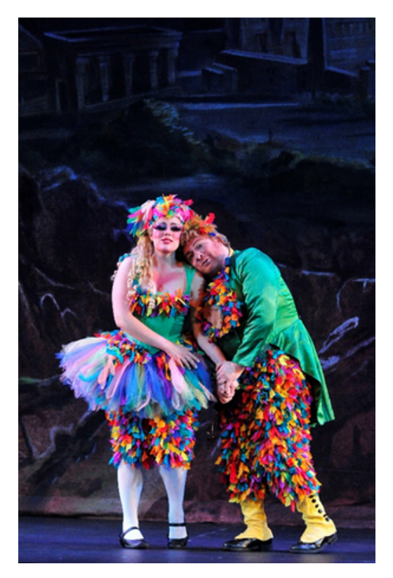
Nashville Opera's 2013 Production of THE MAGIC FLUTE

An aria is a solo moment for an opera singer and is usually accompanied by the orchestra. Italian for "air" or song, an aria stops the plot momentarily, giving each character the opportunity to express their innermost thoughts and feelings. These pieces also provide an opportunity for the singer to demonstrate their vocal and artistic skill. Arias balance memorable melodies that perfectly suit the human voice while still reflecting the drama of the text.