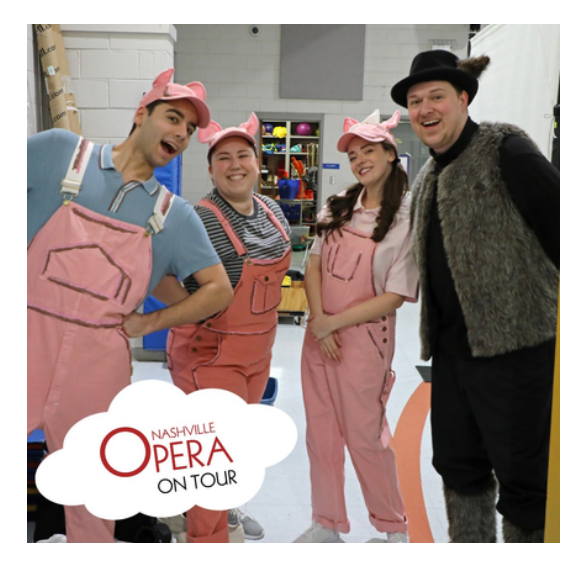
The 2024 Mary Ragland Emerging Artists backstage for THE THREE LITTLE PIGS

Mozart's music catalogue contains over 625 works, and the first was written at age 5!