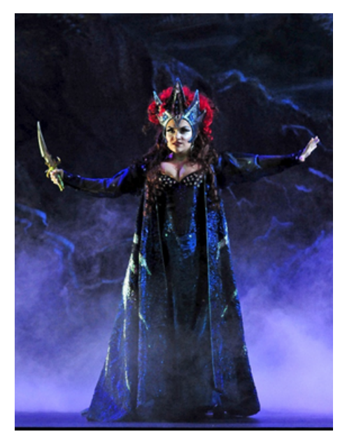
Nashville Opera's 2013 Production of THE MAGIC FLUTE